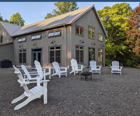
Adirondack chairs / sweetheart table / bonfire